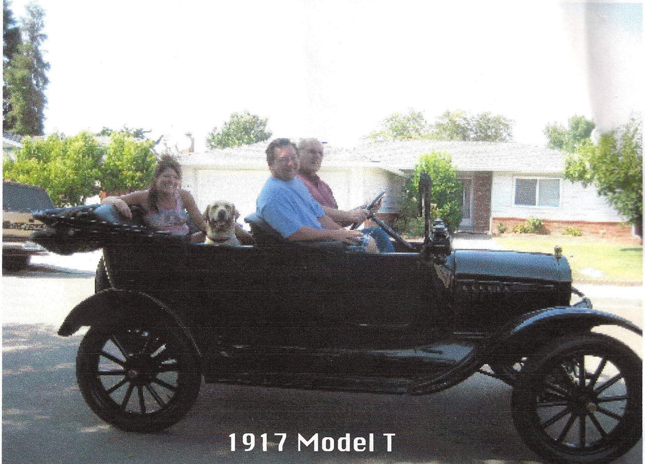
1917 Model T