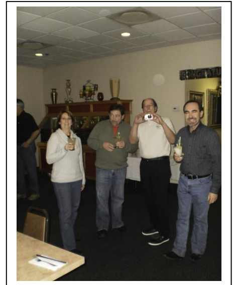
Some FUN photos from Mark: Not Fords but very nice!